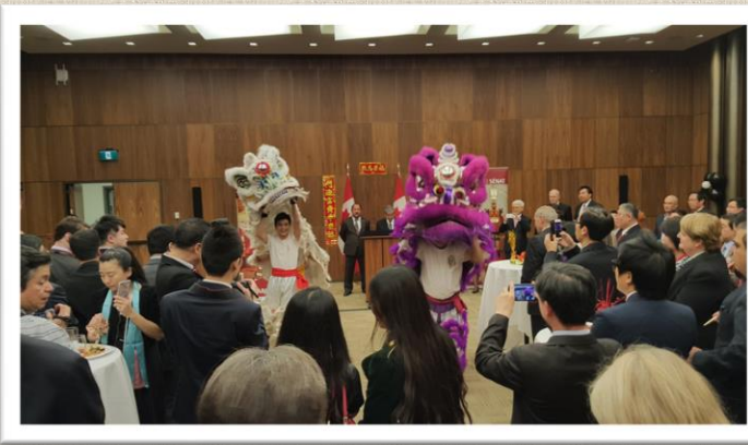
LUNAR NEW YEAR ON THE HILL