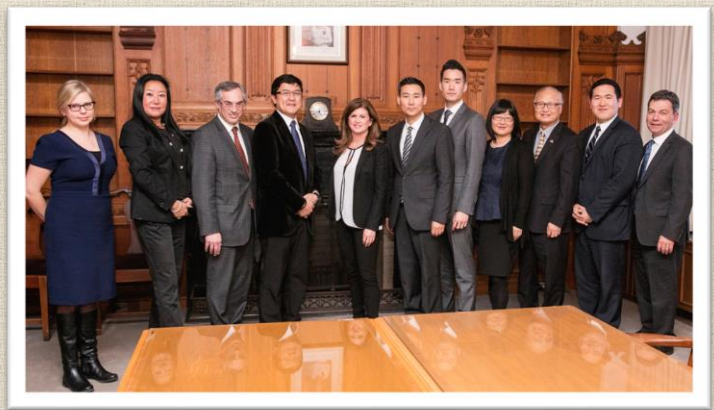
WEEK IN PHOTOS: FEB 15