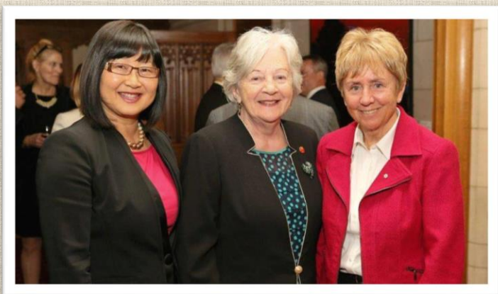
WEEK IN PHOTOS: FEB. 22