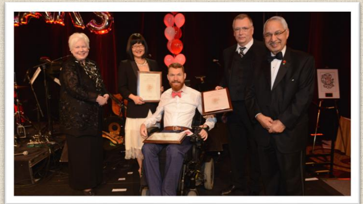
CFPDP GREAT VALENTINE GALA