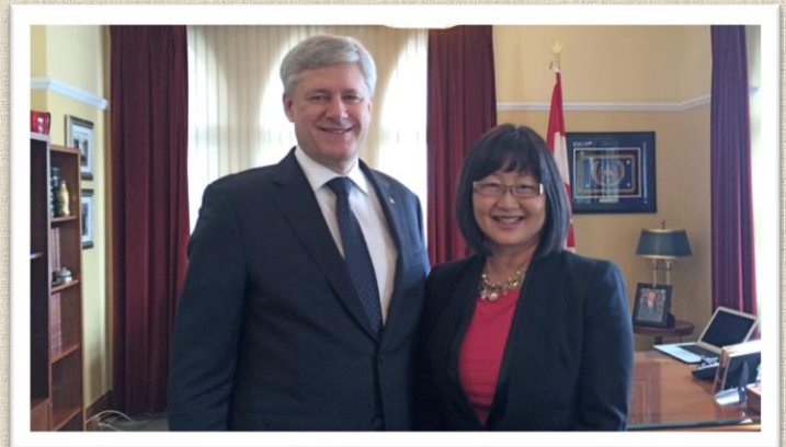
WEEK IN PHOTOS: FEB 1