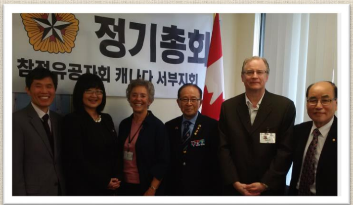
KOREAN WAR VETERANS ASSOCIATION AGM